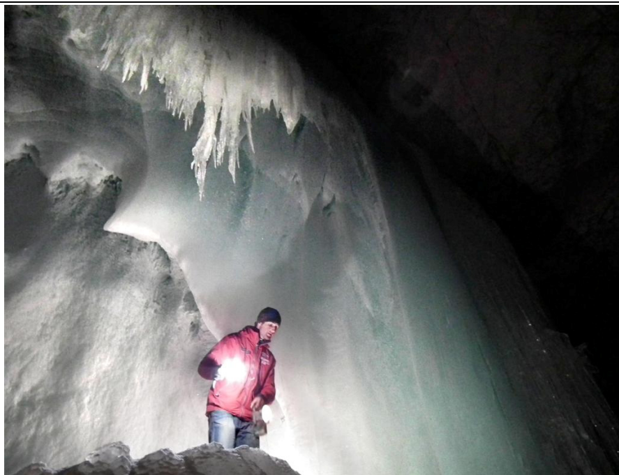
Guide burning magnesium ribbon.

above the cave floor. The discoveries soon attracted tourists and a small cabin “Forscherhütte” (Discoverer’s Refuge) was constructed in 1920 as well as a primitive climbing route established to the cave and into its interior. By 1924, the ice covered sections of cave were accessible to tourists without the need for climbing gear. However it was a long arduous steep walk up the mountain from Werden.