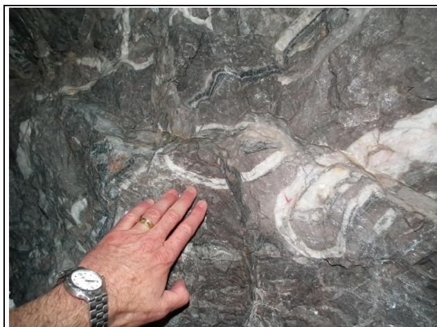
Fossils at 1640m ASL at entrance to Eisriesenwelt.

A combined cablecar/cave ticket is priced at €20 for adults, €18 for members of mountaineering or caving clubs, and €10 for children of 14 and under. If you're feeling super energetic it is possible to save some money by hiking up and down the mountain or taking the cablecar in just one direction. Up-to-date information can be found at the official website [ www.eisriesenwelt.at ]