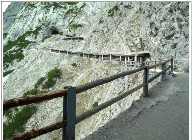
Final section of path leading to Eisriesenwelt.