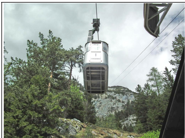
Cablecar to Dr Oedl-Haus restaurant.

Eisriesenwelt is open to tourists from 1 st May until 26 th October. The guided 75-minute tours start at 9 am, with the last tour departing at 3:30 pm, (4:30 pm in July and August).