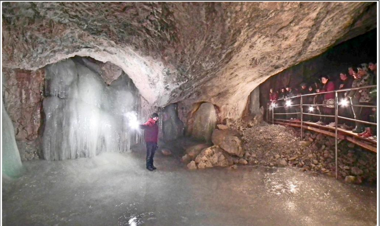
The guide burns magnesium ribbon to illuminate ice decorations in Eisriesenwelt.

visitors can purchase a drink, snack, meal, or rent a simple room for the night. From this point there are excellent views of the Salzach Valley and town of Werten far below.