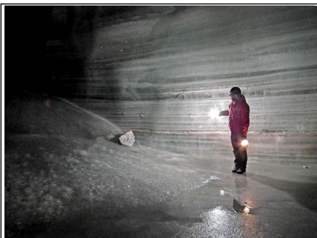
Layers of ice contain valuable record covering 1000 years of the earth's history.

Thankfully I had rugged up at the entrance. Twenty metres inside the entrance the breeze subsided and eventually was not noticeable in the large chambers.