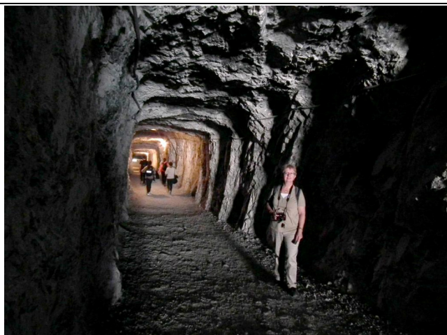
Looking along the shortcut tunnel on track to Eisriesenwelt.

Tourists can travel to the area by private vehicles or by using several modes of public transport (train, bus & taxi). Alternatively several companies run half day coach tours from Salzburg to the Cave. The coach route passes through the township of Werfen (548m ASL) nestled in the valley between two huge limestone mountain ranges towering some 1900m + above the valley floor. The narrow road winds steeply up to a small parking area next to the new welcome-centre (ticket office and souvenir shop). From here there is a 15 minute walk up a well graded track which winds around the side of the steep mountain. A tunnel through one ridge can be used to reduce the walking distance to Wimmer Hütte, where the cable car lower station is located. A 15 person gondola takes visitors up a further 500m in 3 minutes to an elevation of 1586m where a restaurant (Dr. Oedl-Haus) is perched on the side of the mountain. Here