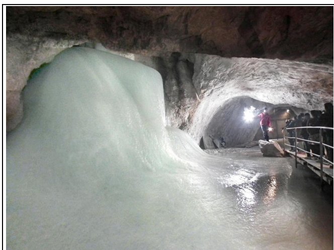
Ice decorations in Eisriesenwelt.

The walk up the mountain was very pleasant on the day we visited, however it was probably the exception to the norm. Hence be sure to take warm clothes and raincoat for the walk up the mountain and include gloves to be able to hang onto the frozen metal handrails inside the cave. Also wear good insulating shoes with thick