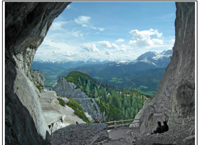
Looking out the entrance of Eisriesenwelt Cave.

A timber walkway throughout the tourist part of the cave, leads visitors through a series of large chambers and connecting passages, past magnificent ice decorations, climbing steeply in places over large ice flows to an elevation of 1775m.